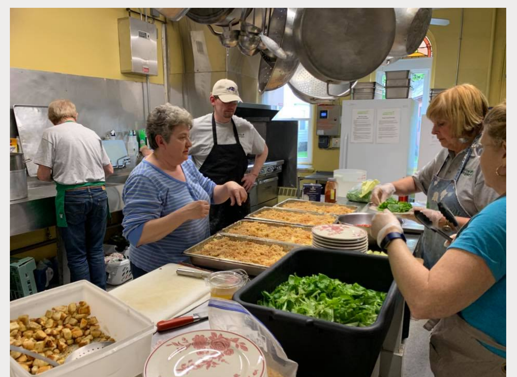
Volunteers preparing for the O+ dinner.