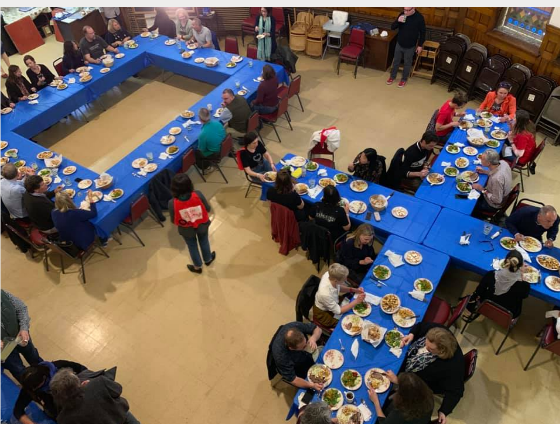
Our dining room set up for the meal.

Do you know about the O+ Festival (pronounced O Positive)? Underinsured artists and musicians create and perform in exchange for a variety of services donated by doctors, dentists and other care providers. This is the first year the festival came to North Adams and we were thrilled to be involved! We worked with A-OK Berkshire Barbecue to serve a meal to the artists, musicians and festival organizers right at the Berkshire Food Project! Next year we hope to expand and have the meal open to the whole community!